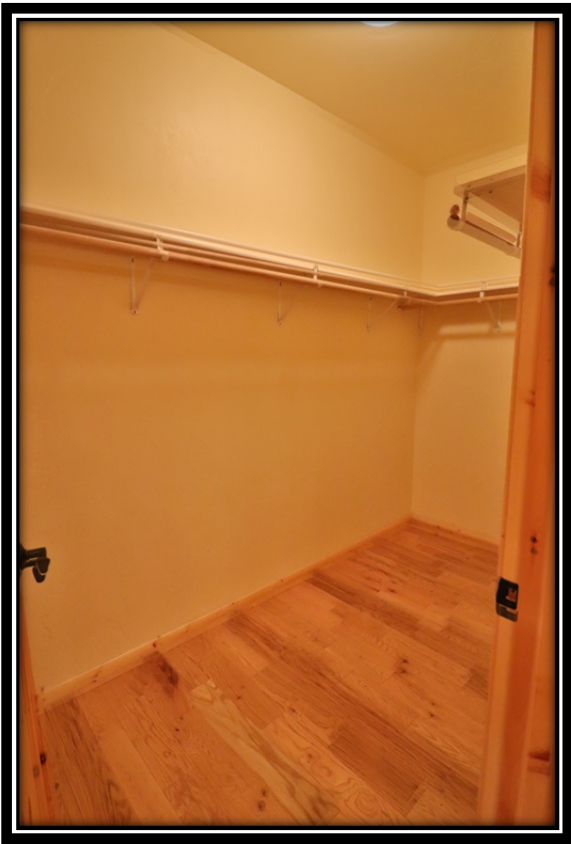
Master Walk-in Closet