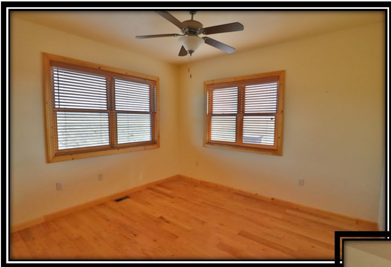
Bedrooms Two & Three