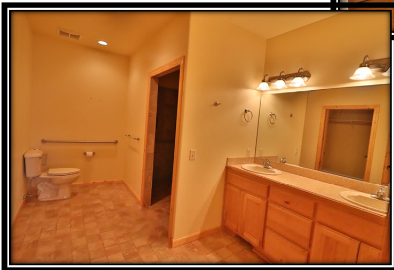
Master Bath with Walk-in Shower