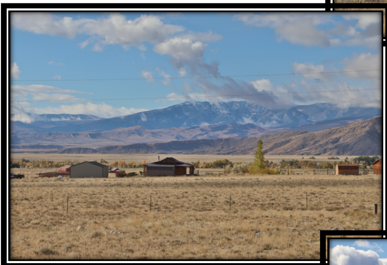
View of Heart Mountain