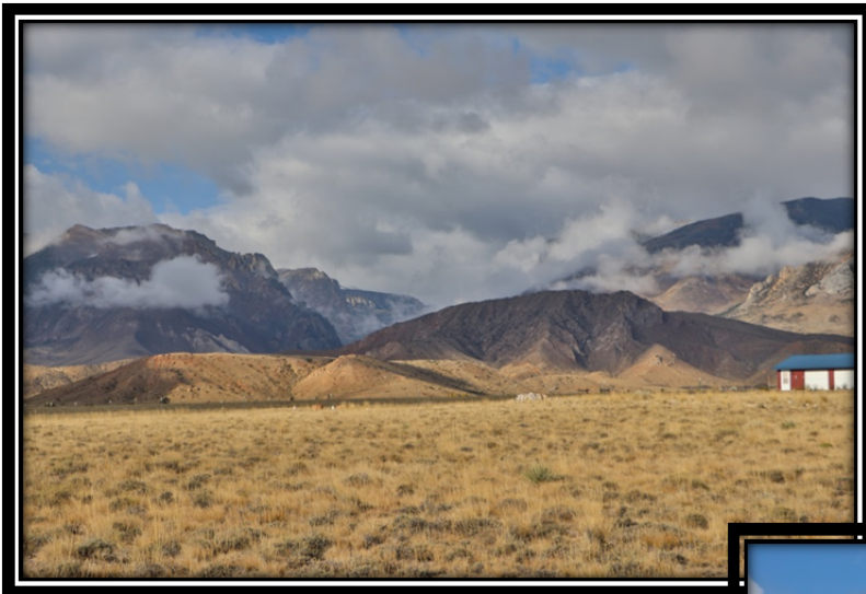
Views of the Beartooth Mountains